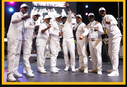
DURTI-RYCE featuring DERON Frankie Beverly and MAZE Tribute Band